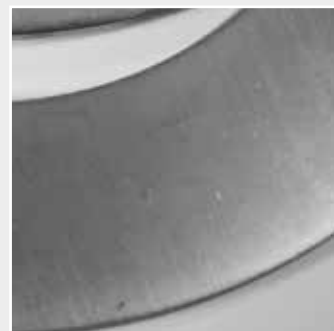
After hybrid cleaning using VAIOCS technology.